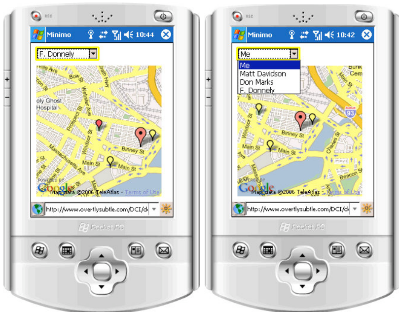
Figure 1: A presence and location DCCI implementation mashup.

The Open Mobile Alliance [OMA] has developed a set of properties call User Agent Profiles [UAPROF] describing static characteristics of mobile phones. Device vendors are expected to define additional properties for proprietary features. Such properties can be mapped into a DCCI framework.